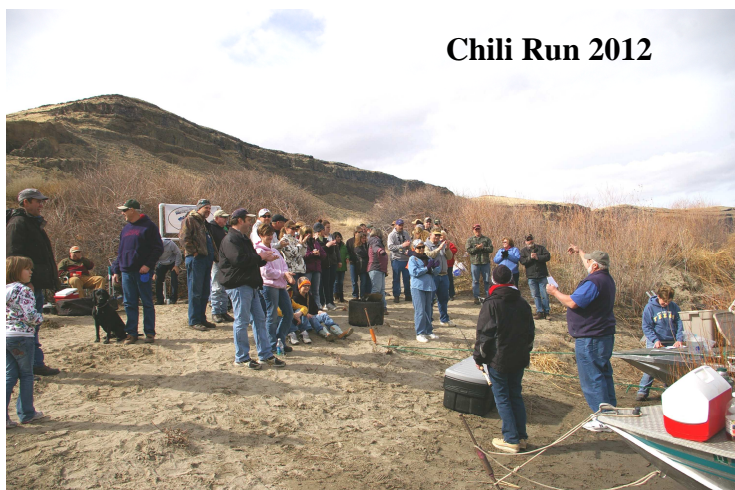
Chili Run 2012