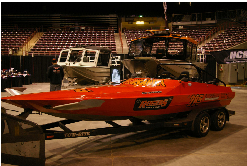
One of the race boats displayed at this year’s Annual Banquet/Fund Raiser.