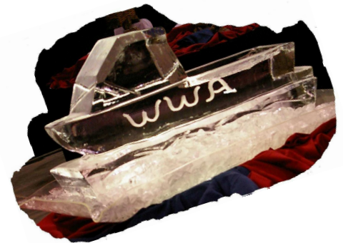
Ice Sculpture furnished courtesy of Bob and Becky Hays.