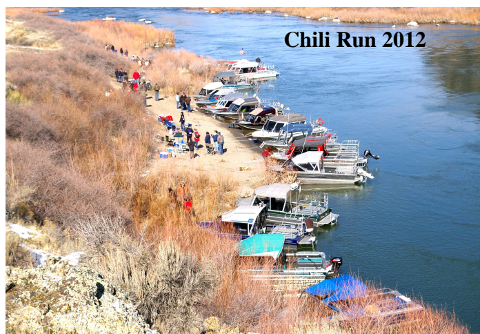
Chili Run 2012

Wow! What a day! Unlike the Pre-Run, the wind was quiet and the river gods blessed us with a safe day on the river. Nineteen Jet Boats navigated "Suicide Bend", "Grave Yard", "Pump House" and "Ranch House". Once the river rats were all out of their water craft and safely on the beach the event began. Soon after 6 back country kitchens were up and running, marking the beginning of the Western White Water Association's culinary experience of the year. Winners will be announced in the next issue of the Rapids.