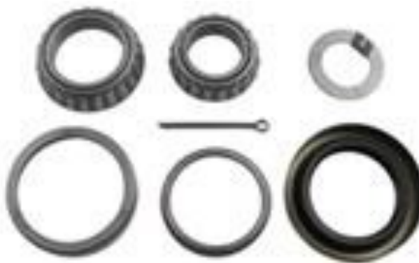
* Bearing kit, etrailer.com

Don't skimp on grease. Use a high-quality, lithium complex