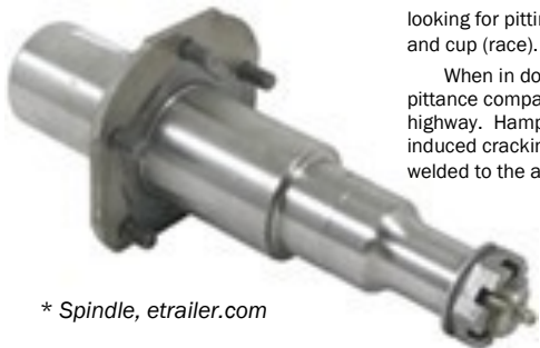
* Spindle, etrailer.com

Don't skimp on grease. Use a high-quality, lithium complex grease that meets or exceeds industry standards. Grease should provide excellent rust protection and thermal stability. If your trailer has an enclosed hub system (such as Bearing Buddies, Sure-Lube or Super Lube), do not pump them full of