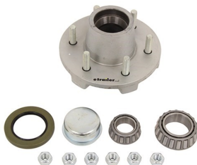
* Trailer hub assembly etrailer.com

Double check your truck-trailer connections: receiver, pin and clip, hitch ball and coupler. Five minutes could save you a major headache or prevent a tragic accident.