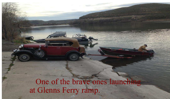
One of the brave ones launching at Glenns Ferry ramp.