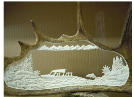
This unique carved Moose Antlers from Unique Antler Designs in Riggins will be auctioned at the Banquet January 17, 2015.