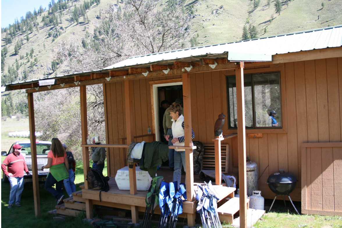
Photo of the cabin on the north side of the river across from Mackey bar. This is the building our club donated money to help add on too.