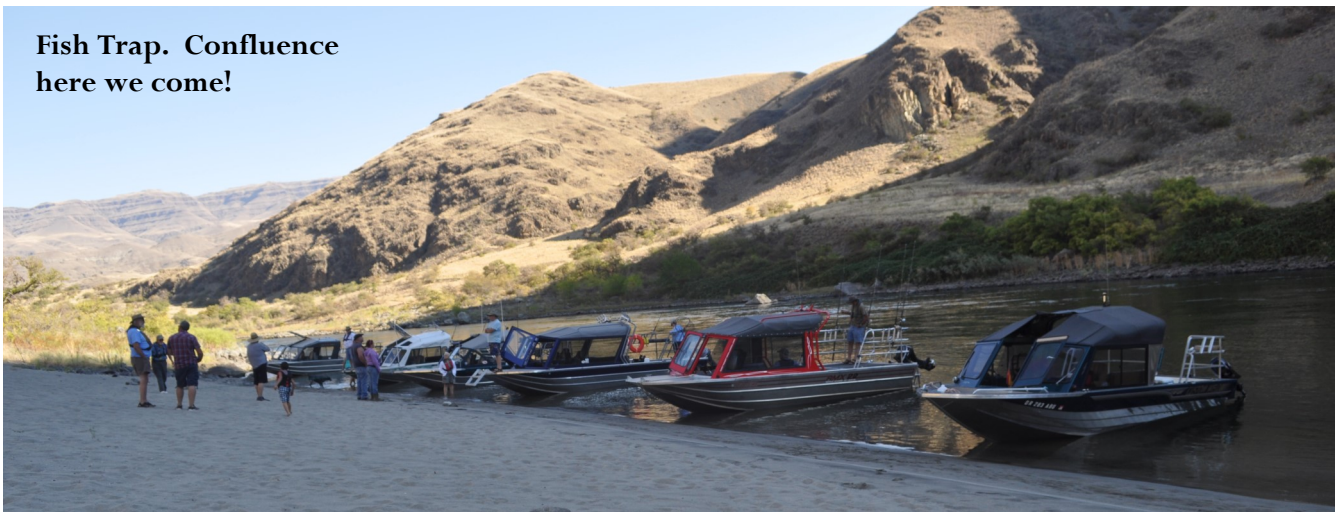
Fish Trap. Confluence here we come!