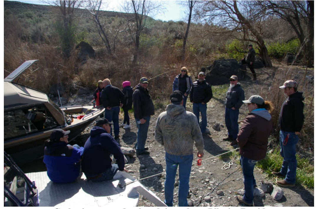
Gathering around at beach just above Pilgrim Rapid