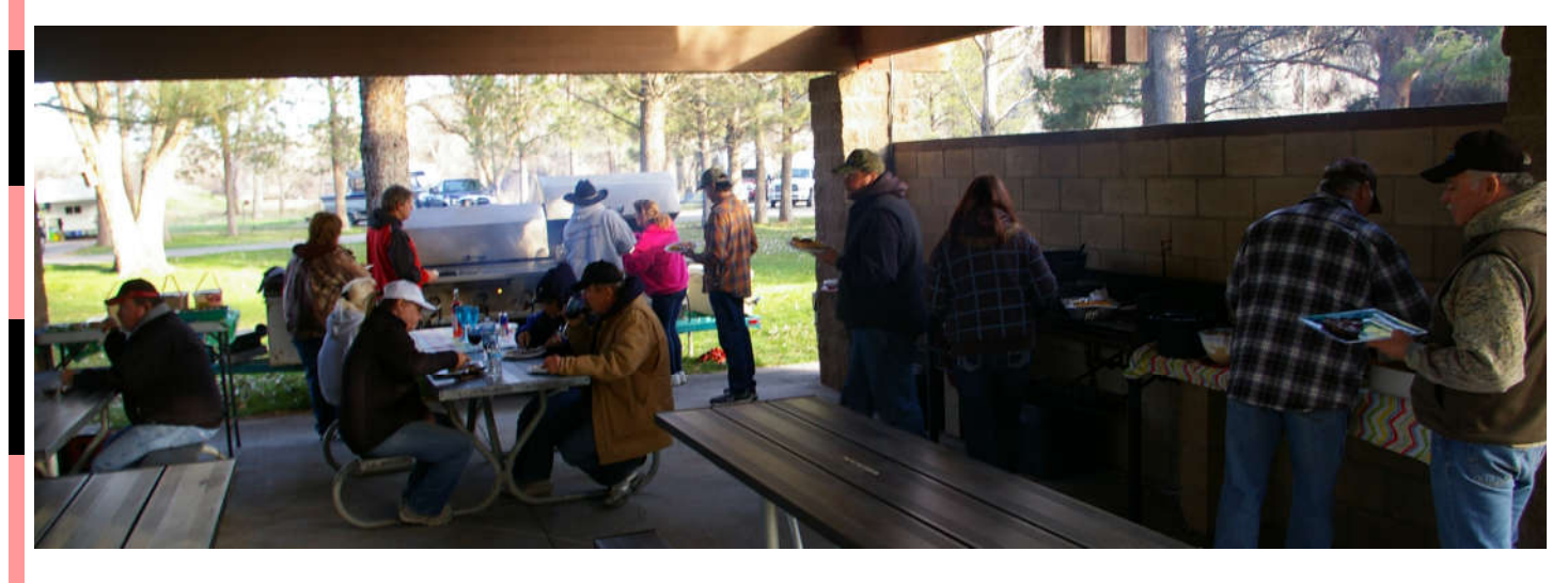
Another enjoyable meal and fellowship with other WWA members