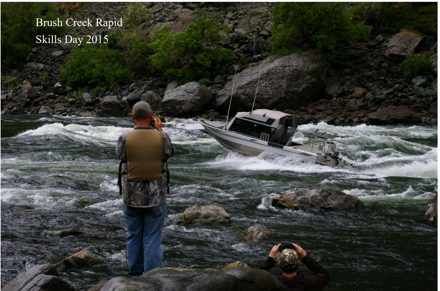
Brush Creek Rapid Skills Day 2015