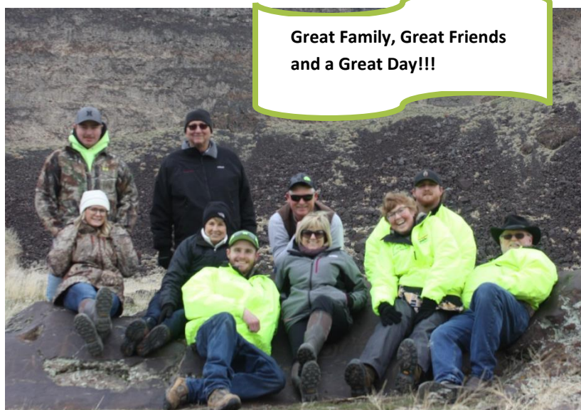
Great Family, Great Friends and a Great Day!!!