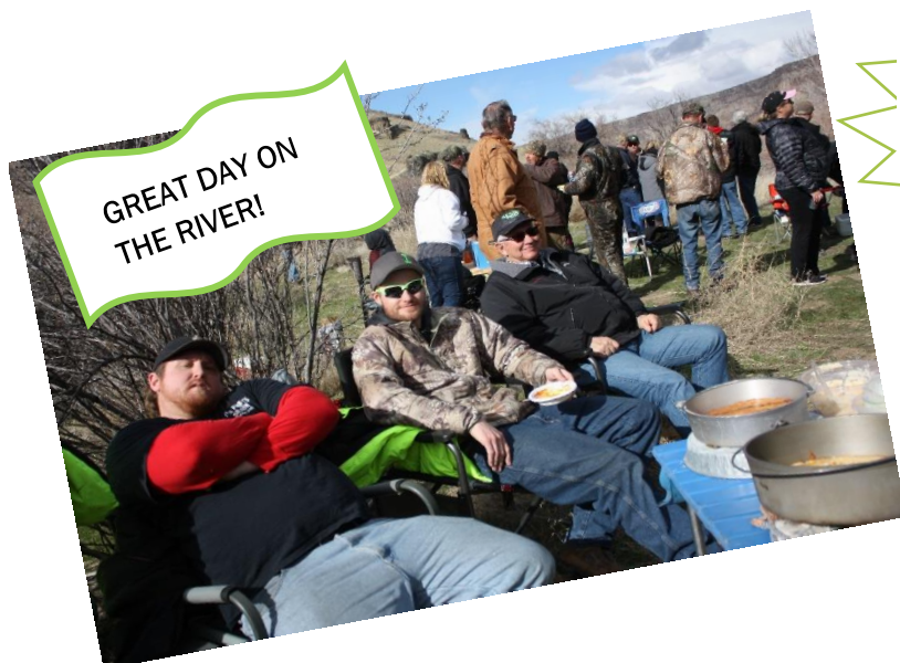
GREAT DAY ON THE RIVER!