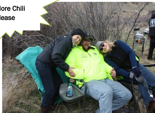
More Chili Please