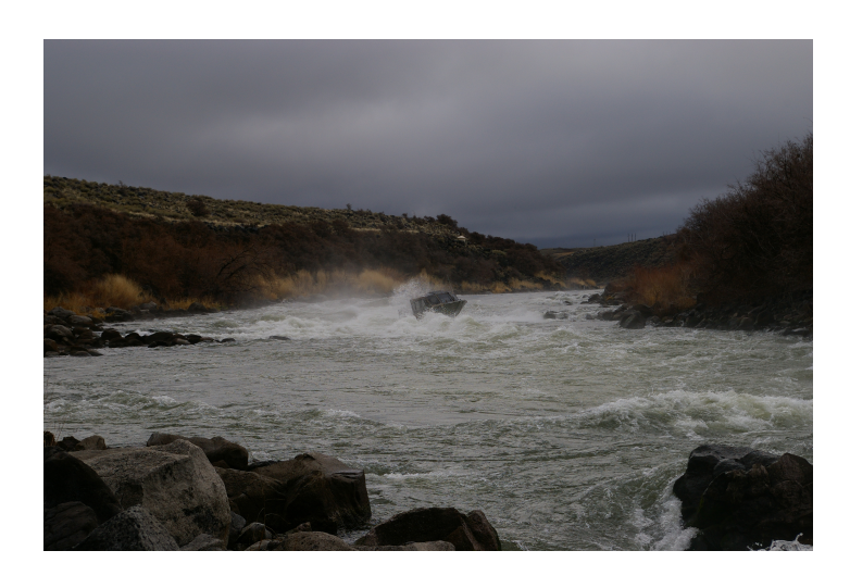
Can you identify this rapid?