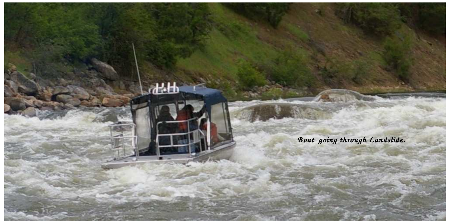
2010 Weed Run

There were approximately 32 volunteers that participated on the Salmon River weed run on May 14th, 15th and 16th. On Friday morning, 7 boats headed up to James Ranch where base camp was set up. By Friday afternoon we started spraying noxious weeds at James Ranch and at Warren Creek. On Saturday, everyone was sent up to Mackay Bar to spray weeds from the pack bridge on the Main Salmon River up to the pack bridge on the South Fork of the Salmon River. Afterwards, the group went up to Buckskin Bills to tour through the mu-On Sunday morning crews were put together to finish up some additional spraying at James Ranch. The primary weeds controlled were Spotted Knapweed and Rush Skeletonweed. Thanks to Afton Baker with Cargill, Inc., who donated $1,000 to the WWA in the efforts to fight the battle against noxious weeds. All in all, it was a great trip. The weather was sunny, the comradery was great and the food was excellent. A special thanks to Jim, Rich and the rest of the cooks who helped to prepare the great meals.